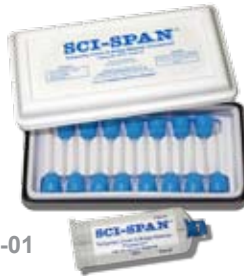
Cat. No. 58-01