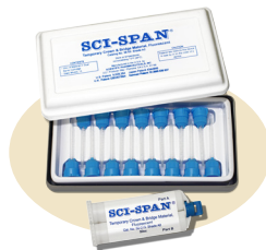
Cat. No. 58-03